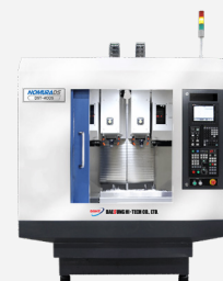
Nomura DS DST-40DL