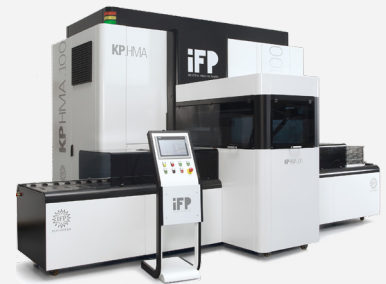
iFP KP.HYBRID 100