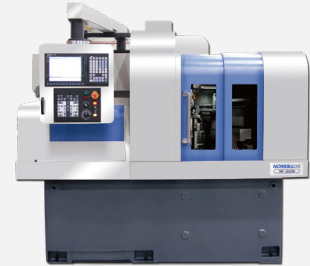
Nomura DS NN-20J3XB Type C