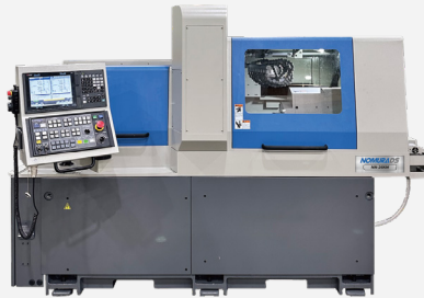
Nomura DS NN-26KMY