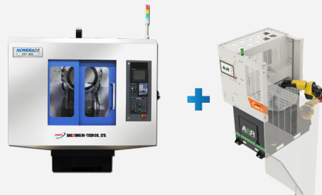
Nomura DS DST-40L W/AWR RC-1