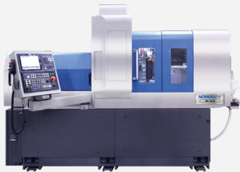
Nomura DS NN-38J