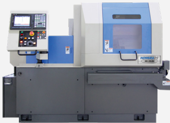
Nomura DS NN-25UB8K Price: $99,900